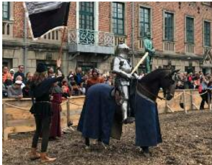
Above: Newcastle upon Tyne's Norman castle keep. Right: Nyborg Castle festival.

The Château de Neuchâtel, Switzerland, was a castle begun in the 12th century, but, possibly with its origins in an earlier Novum Castellum first mentioned in 1011. It is an imposing building in the old town next to the parish church.