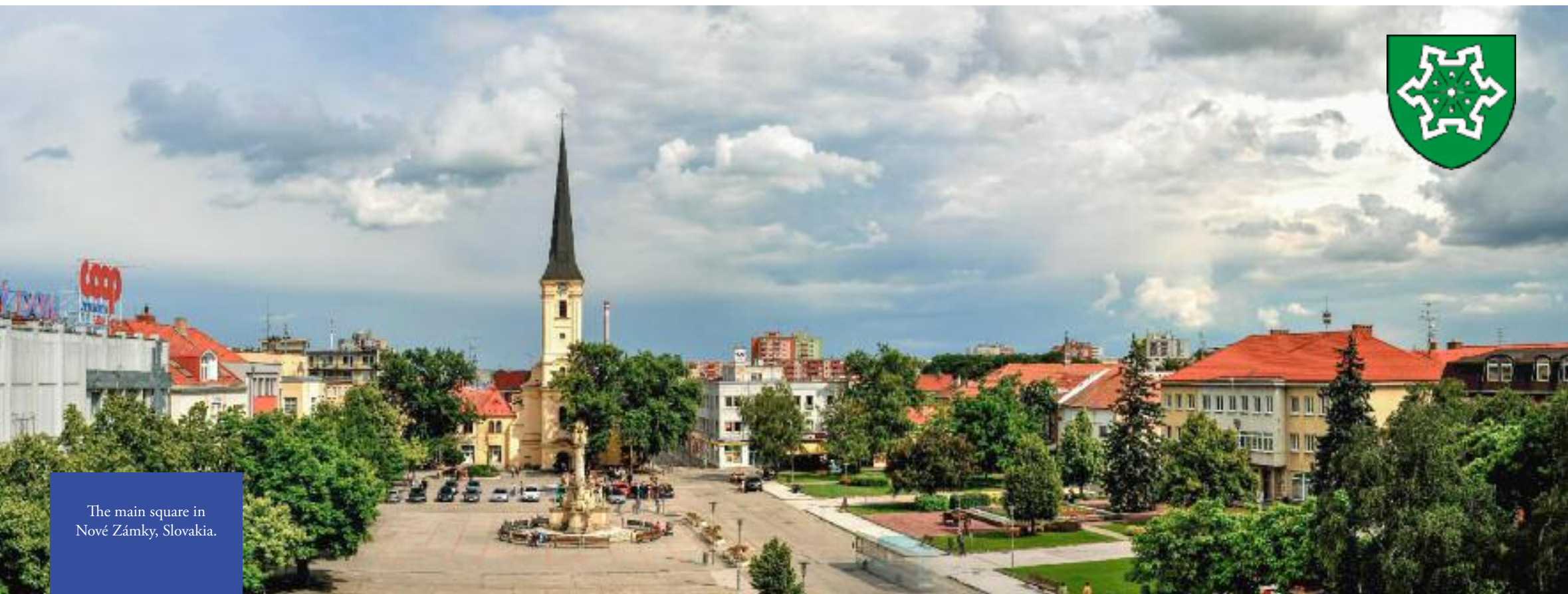
The main square in Nové Zámky, Slovakia.

Nové Zámky was represented at an exhibition called Spring in Newcastles 2017 in Nové Hradky. In the future, Nové Zámky plans to participate in other projects with Newcastles of the World.