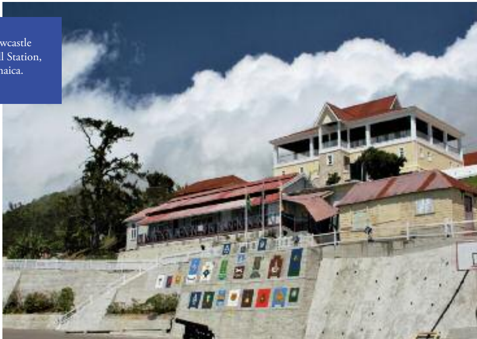
Newcastle Hill Station, Jamaica.

Today, Newcastle is part of the Blue Mountain and John Crow Mountain National Park and surrounded by coffee plantations, vegetable farms and hiking trails which provide the main income for the 1,500-strong population of Newcastle and surrounding districts.