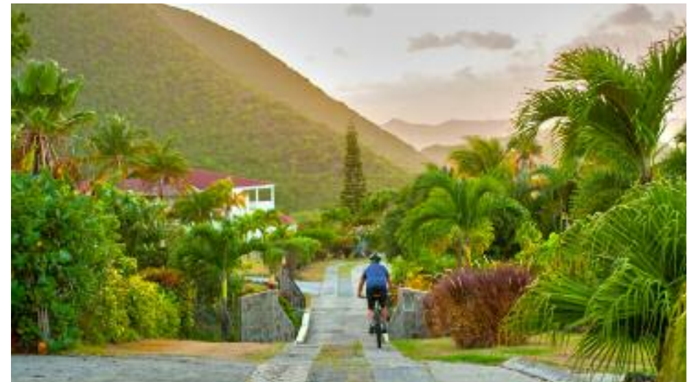
Newcastle, Nevis, West Indies.

St Kitts and Nevis was virtually a sugar monocrop economy until the late 1970s, when the government backed a drive into small-scale industrialisation. Tourism has become the largest source of foreign exchange. From 1984 a small offshore sector on Nevis grew rapidly, with around 18,000 companies registered.