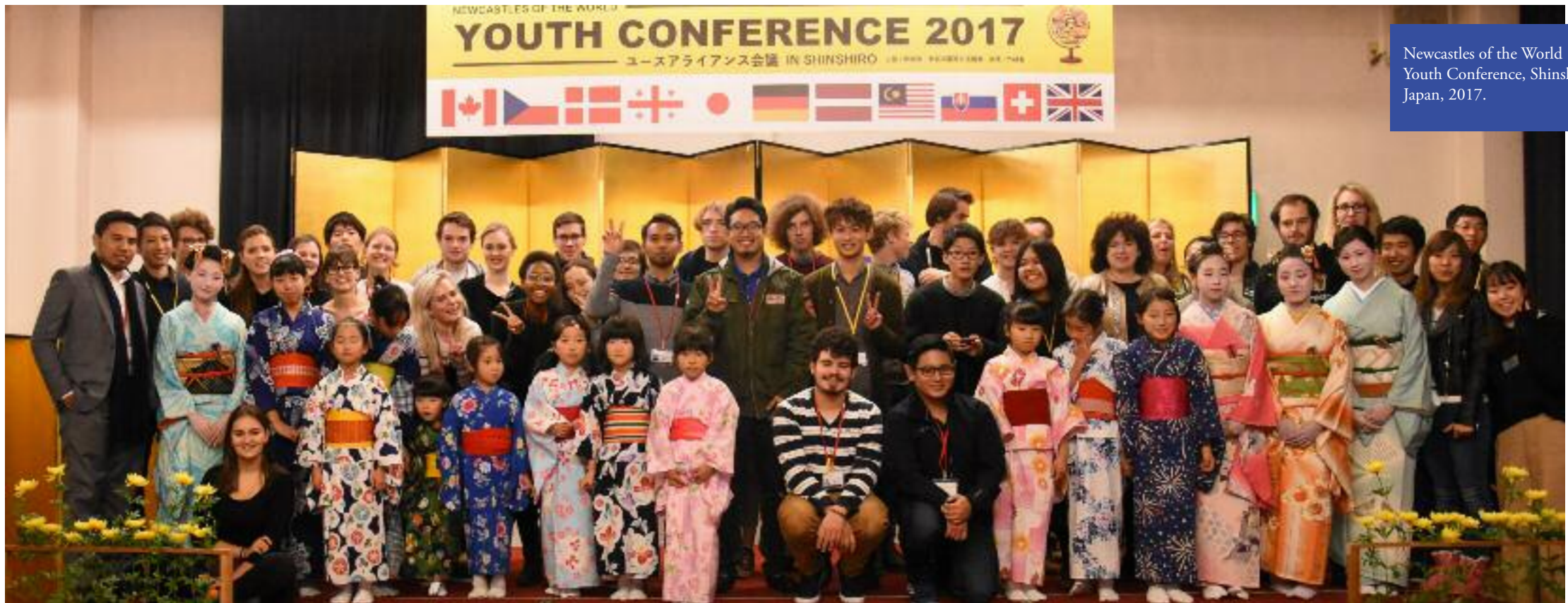
Newcastles of the World Youth Conference, Shinshiro, Japan, 2017.

Our conferences create a platform for both taking stock of progress and identifying areas for cooperation up to the subsequent conference. We enjoy the hospitality of the host Newcastles and finding out about their towns, each with their distinctive cultural and heritage. In recent years it has also been possible to ensure that sufficient young people are amongst our delegations for them to have their own discussions and present proposals for working together and ensuring that their voice is heard. So much so that our very first dedicated youth conference was held in Shinshiro in December 2017 with ten Newcastles sending thirty youth delegates, and a similar number from the host city who so generously proposed and supported the initiative. In 2018, we return to where it all started for the 20th anniversary conference at Shinshiro.