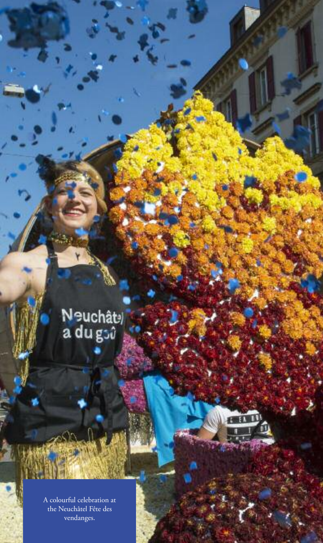
A colourful celebration at the Neuchâtel Fête des vendanges.