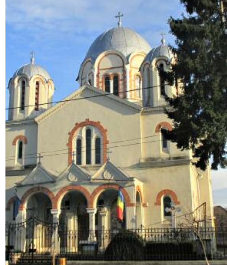
Gherla Cathedral, Romania

The city of Gherla, in the north of Romania, has a population of over 20,000. Its downtown is little changed since it was first laid out in the 18th century by a community of Armenians who settled in Transylvania after fleeing invading Tatars - though the city goes back to the 13th century. The Armenian settlers built the centre in a grid style (ahead of New York) with four straight and parallel streets intersecting at right angles, all opening to the River Someş. There is a large central square, numerous monumental baroque buildings (with