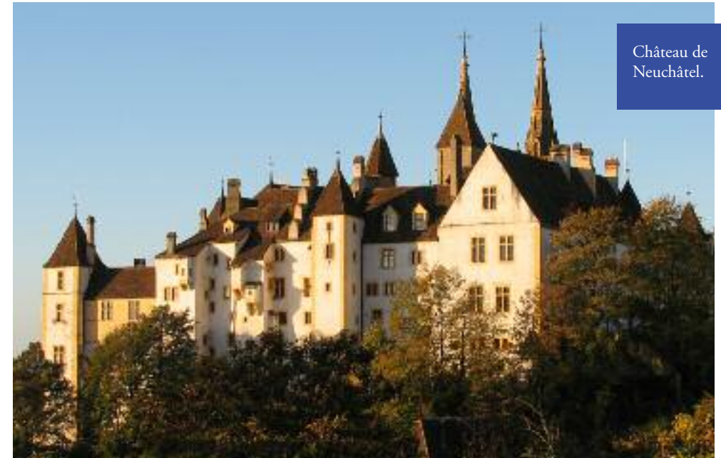
Château de Neuchâtel.

The Château de Neuchâtel, Switzerland, was a castle begun in the 12th century, but, possibly with its origins in an earlier Novum Castellum first mentioned in 1011. It is an imposing building in the old town next to the parish church.