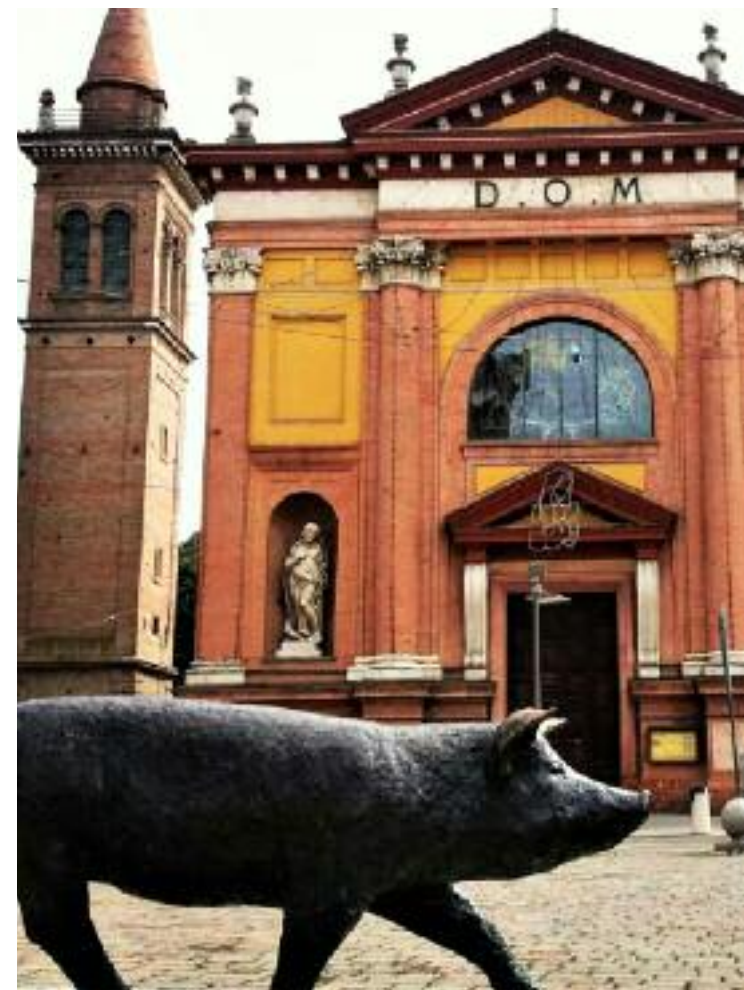
Castelnovo Rangone, Italy is famous for its pork.

Castelnovo ne' Monti, Province of Reggio Emilia, Emilio Romagna region in the Apennines, central Italy (10,500); it is best known for the Pietra di Bismantova spur (literally 'Rock of Bismantova') which can be seen from a distance of 30 kilometres (19 mi) as it stands at around 1,047 metres (3,435 ft) above sea level. The rock was mentioned by the Italian poet Dante Alighieri in The Divine Comedy .