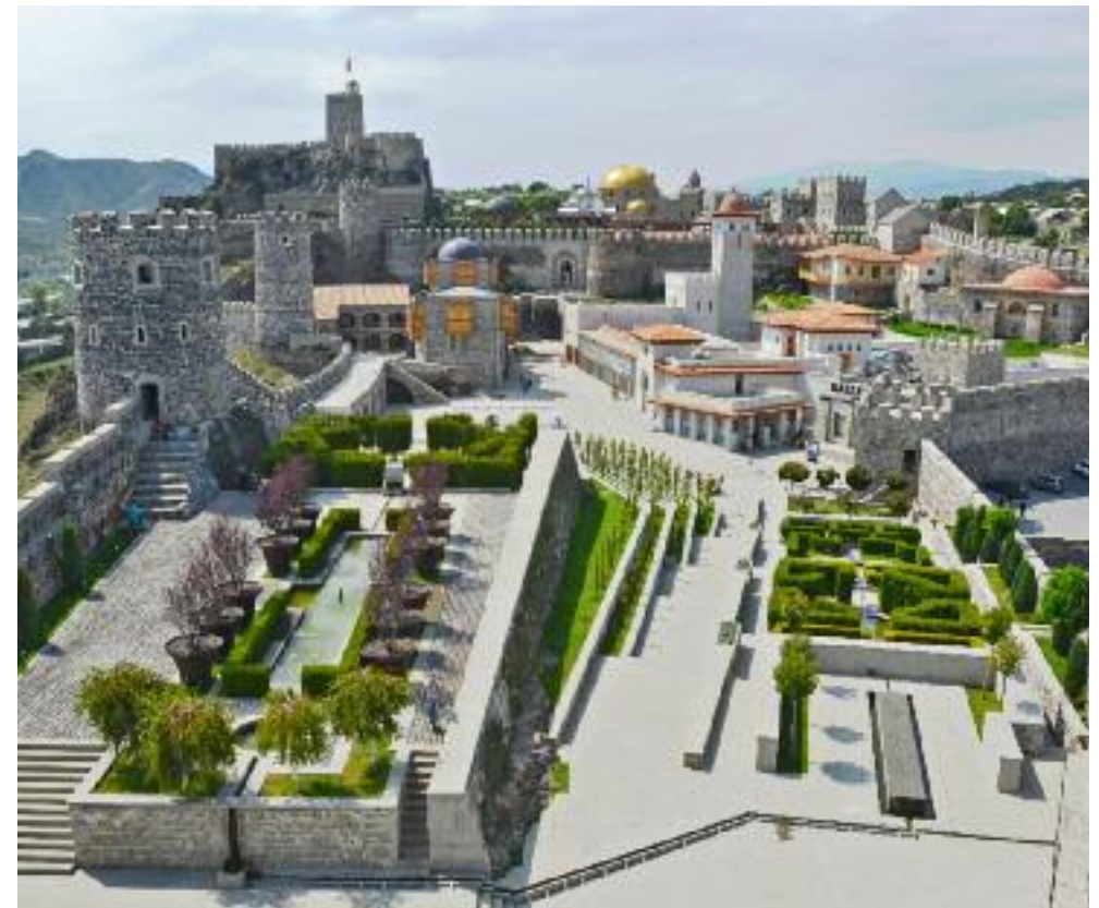
Top: Music and festivities at Akhaltzikhe. Above: Akhaltzikhe Castle.