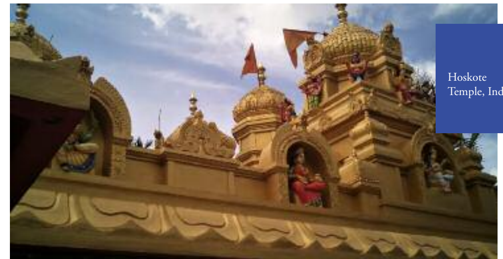
Hoskote Temple, India

The annual Karaga (folk dance festival performed on a full moon day) and the Avimukteshwara Jatre (part religious procession, part cultural festival) attract thousands of people.