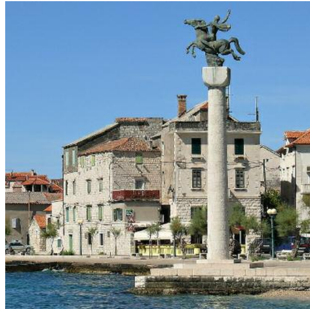
Kaštel Novi, Croatia

In the fields above Kaštel Novi vineyards were cultivated from ancient times. Only a few old species are left, but among them Crljenak kaštelanski, which is known throughout the world and especially in California as Zinfandel. The homeland of the American vine is Kaštel Novi where some vines still grow.