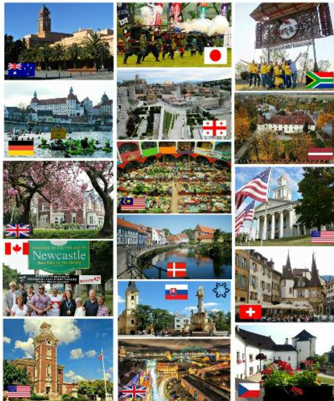
The sixteen Newcastle's of the World network.