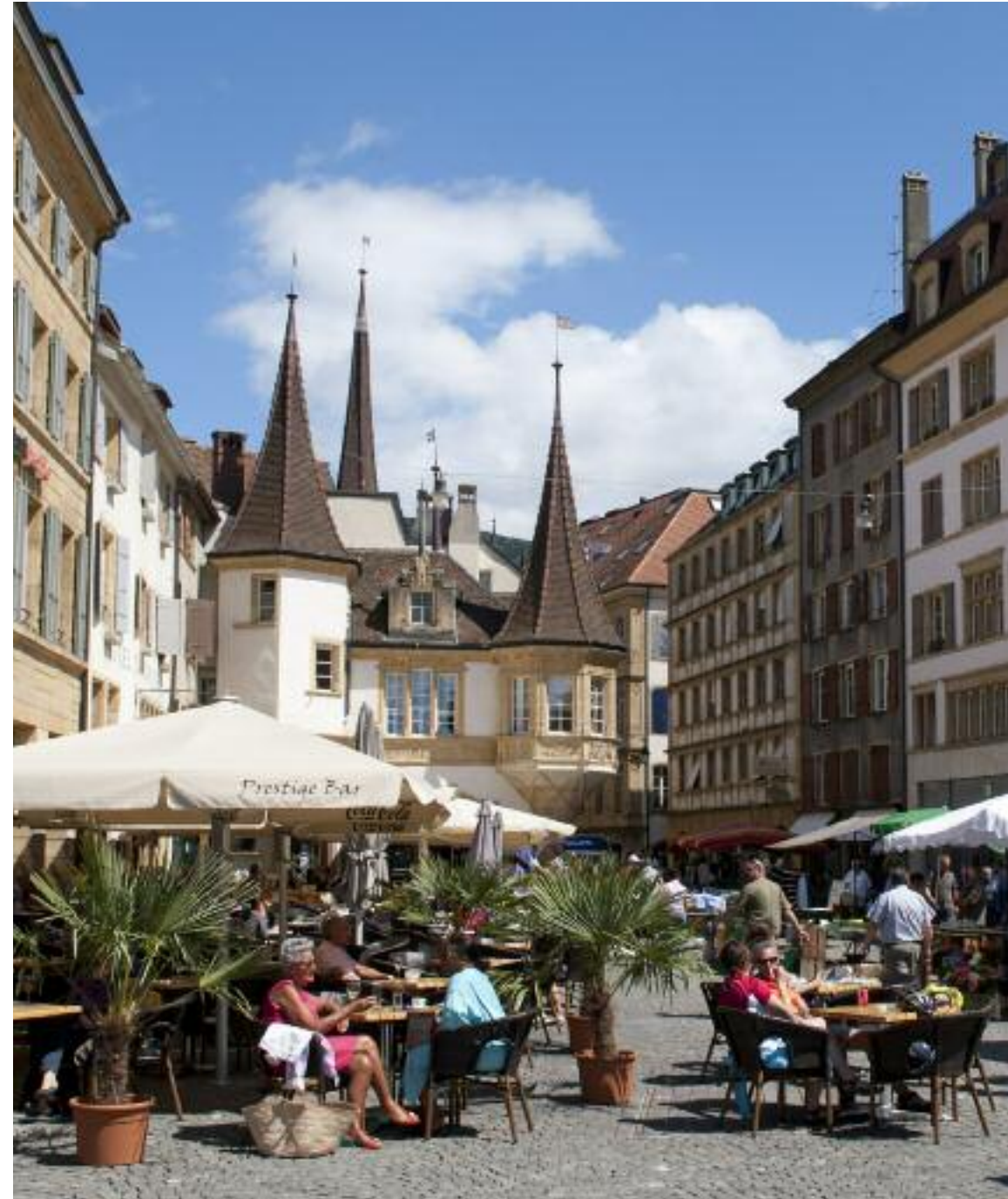
Place des Halles, Neuchâtel

Neuchâtel is an open and internationally active city. It participates in several Council of Europe projects, particularly in the area of integration. It has been a member of the Newcastles of the World since its creation in 1998 and is twinned with a Swiss city, Aarau, and two European cities: Besançon in France and Sansepolcro, in Italy.