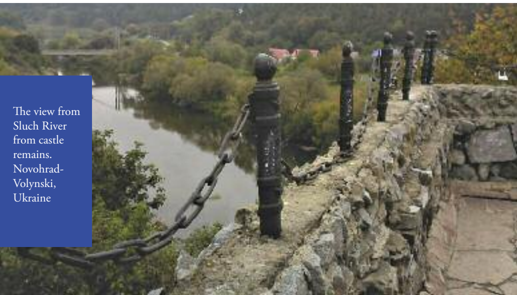
The view from Sluch River from castle remains. Novohrad-Volynski, Ukraine

Novograd-Volynsky boasts many prominent figures in literature, culture and politics but is best known as the birthplace of Lesya Ukrainka (1871-1913), the most famous nationalist Ukrainian writer.