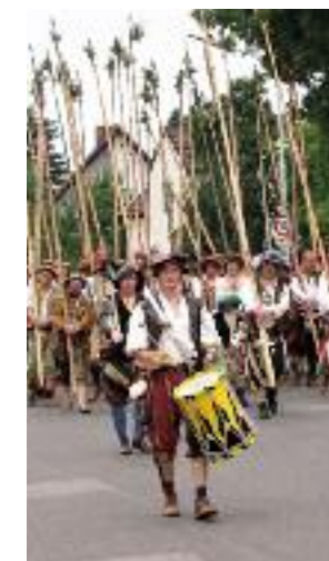
Top: Neuburg Swimming festival. Right: The Christmas Market Far right: Neuburg Castle festival.