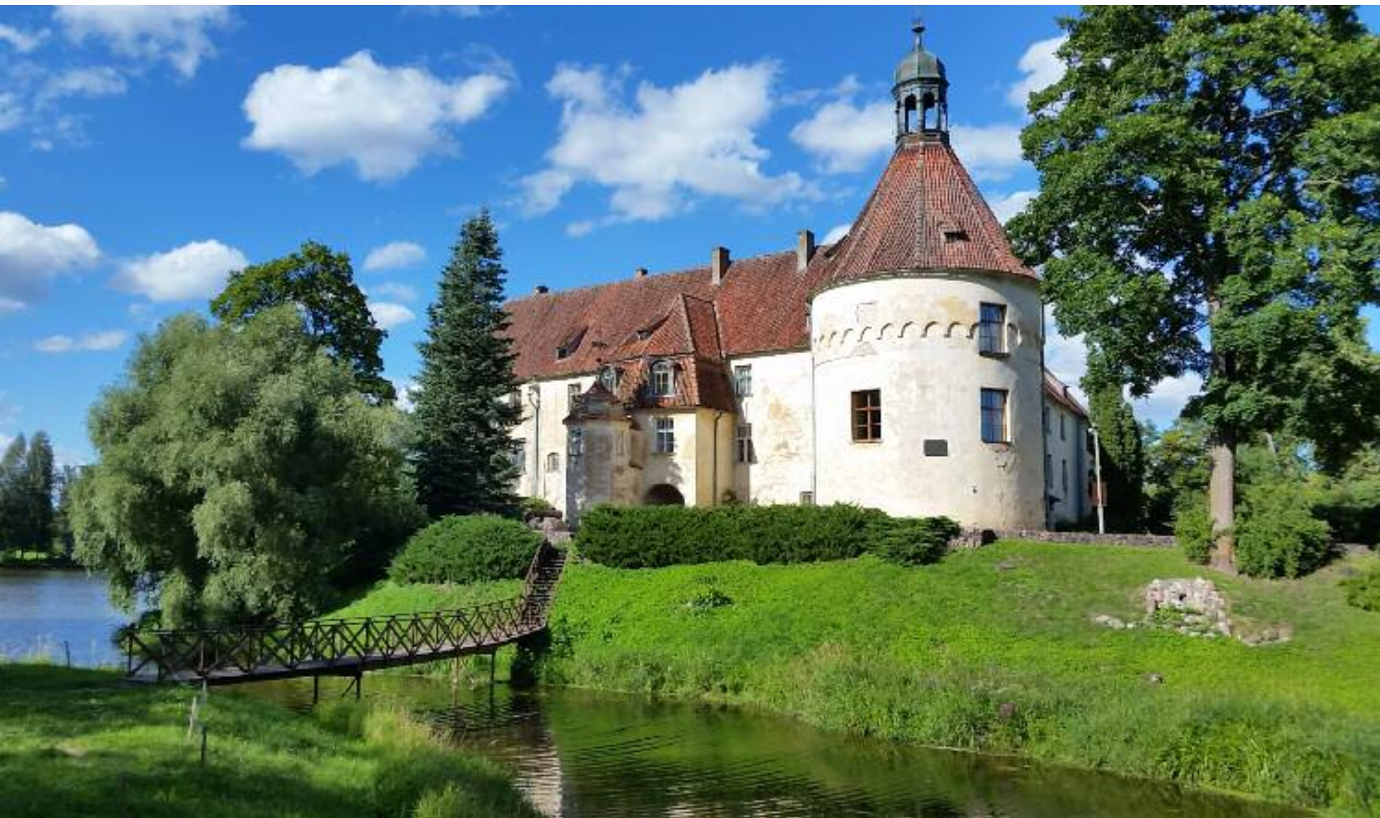
Jaunpils Castle, Latvia.