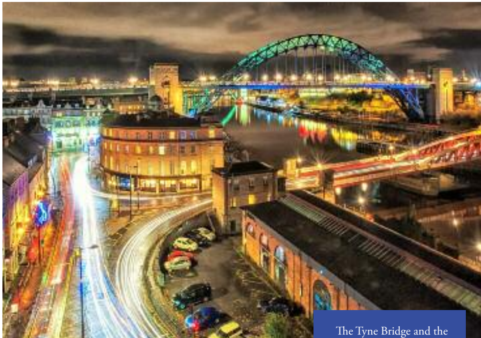
The Tyne Bridge and the Newcastle and Gateshead Quayside along the River Tyne.

Today, Newcastle is known for its theatres, museums and galleries; the annual Town Moor funfair (Europe's largest), its magnificent bridges across the river, Newcastle United football club and other sporting attractions like the Great North Run, the world's biggest half marathon.