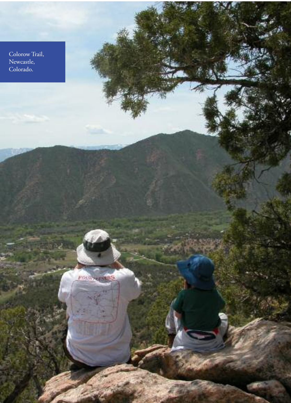
Colorow Trail, Newcastle, Colorado.