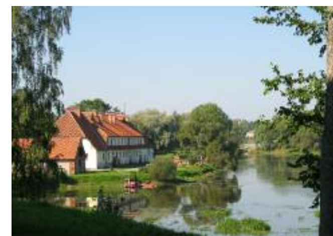
Top left and right: Castle festivities. Middle: Jaunpils Castle. Right: Jaunpils, a rural idyll.