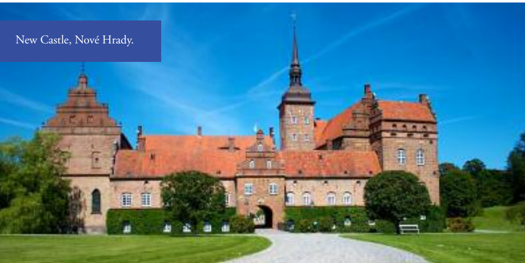
New Castle, Nové Hrady.

Nyborg Castle, Denmark, was built around 1170 and is one of the oldest preserved royal palaces in Denmark. The kingdom's first constitution was signed here in 1282 and the foundations of the Danish parliamentary system laid here. It remained a royal power base until the mid 16th century. Nyborg Castle is currently being restored to its original size and shape and made accessible to the public.