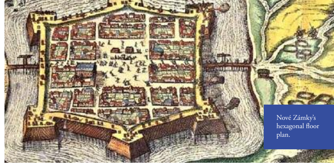
Nové Zámky's hexagonal floor plan.

apart from 'one great Toure.' Today even the tower has gone leaving only a mound and some stonework.