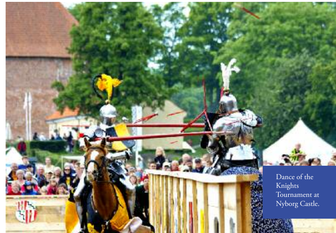
Dance of the Knights Tournament at Nyborg Castle.