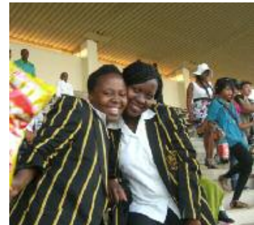
Top: A welcome to Newcastle, South Africa. Right: Newcastle friends all over the world - KwaZulu-Natal.