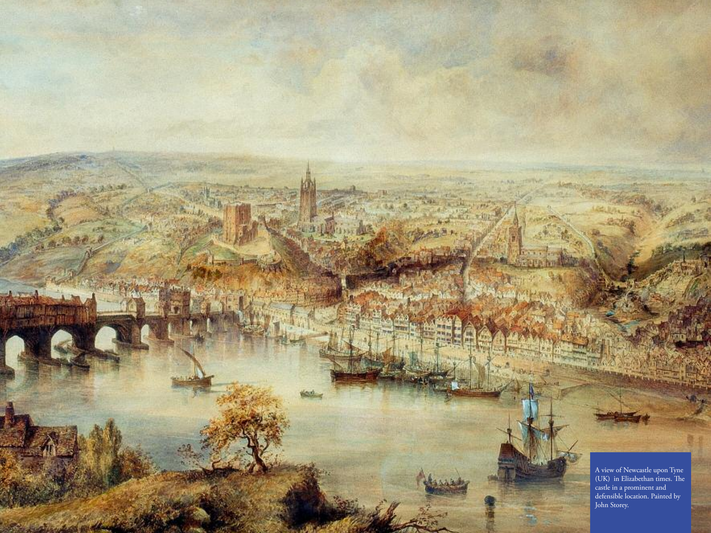
A view of Newcastle upon Tyne (UK) in Elizabethan times. The castle in a prominent and defensible location. Painted by John Storey.