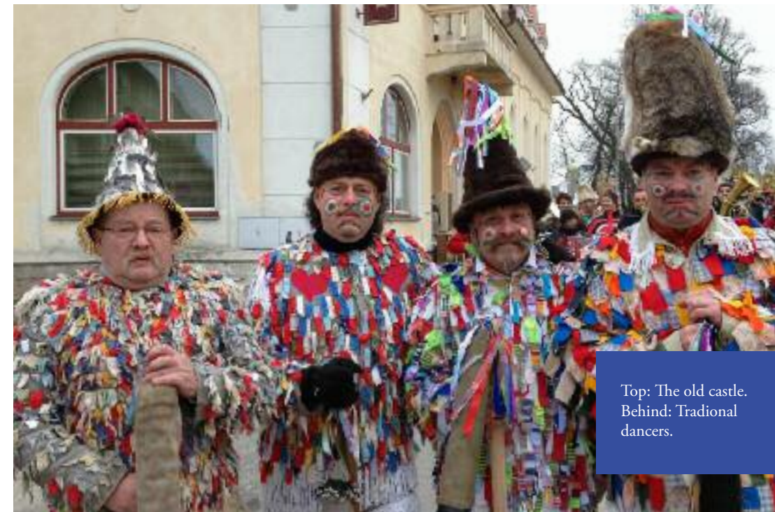
Top: The old castle. Behind: Traditional dancers.