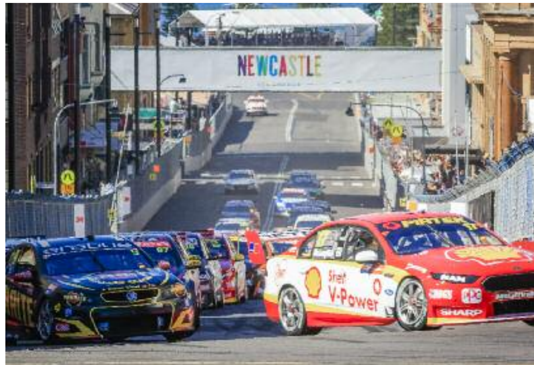
Top: Newcastle's coastline. Above: The Newcastle 500.