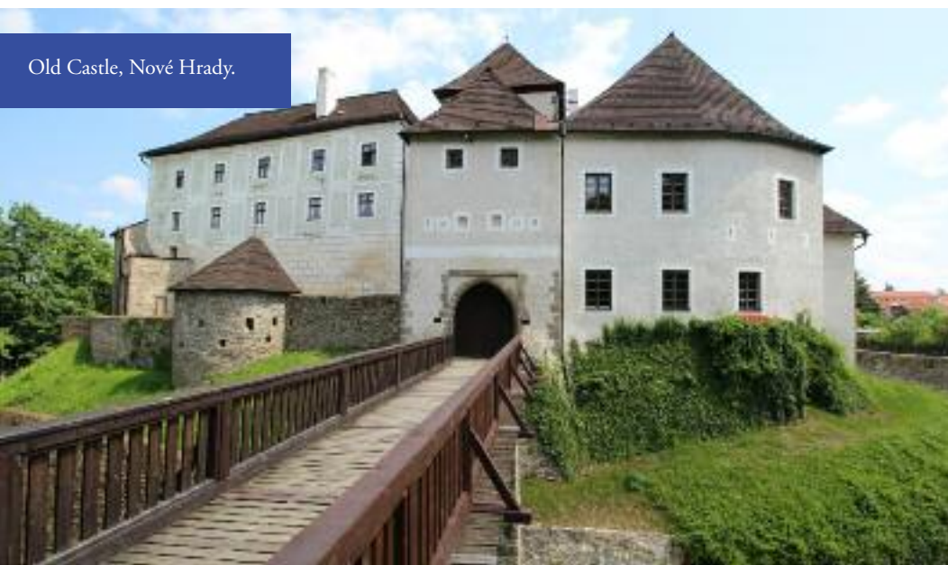
Old Castle, Nové Hrady.

The Czech town of Nové Hrady has two castles. The old one is a Gothic pass-through castle with two gateways situated on a fifty-metre high promontory and surrounded by a fourteen-metre deep moat. It came into the ownership of the Rozmberk family in 1358 and when their line died out in the 17th century it passed to the Count of Buquoy. The new castle was built in the early 19th century by the Buquoy family as a more fitting chateau residence and now houses the Institute of Physical Biology of the University of South Bohemia.