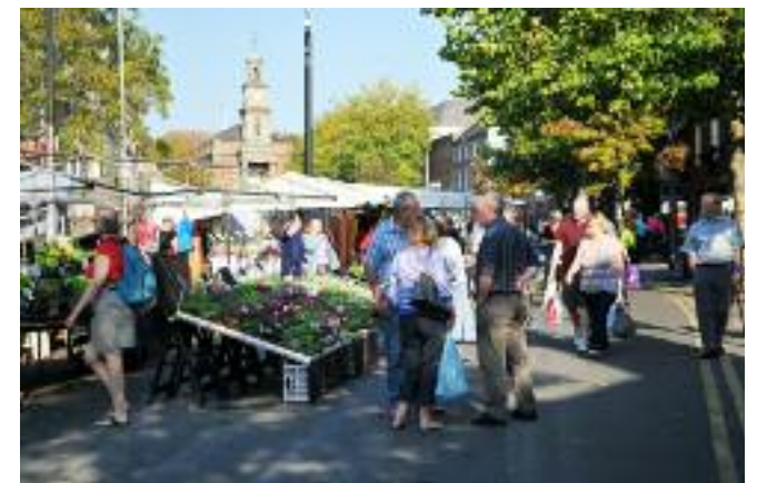
Top: Brampton Park Museum. Above: Newcastle's Town crier. Above right: Queens Gardens. Right: The historic market.