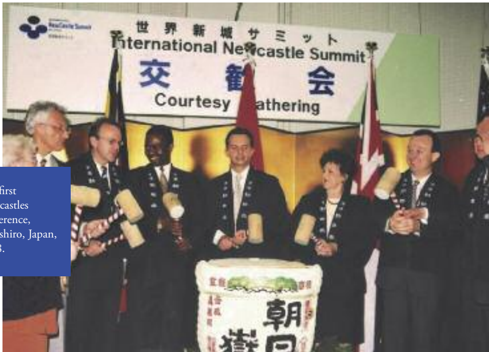
The first New Castles conference, Shinshiro, Japan, 1998.

Promoting interchange between the New Castles in culture, education and tourism was the theme for the second summit two years later in Neuchâtel – and it just happened