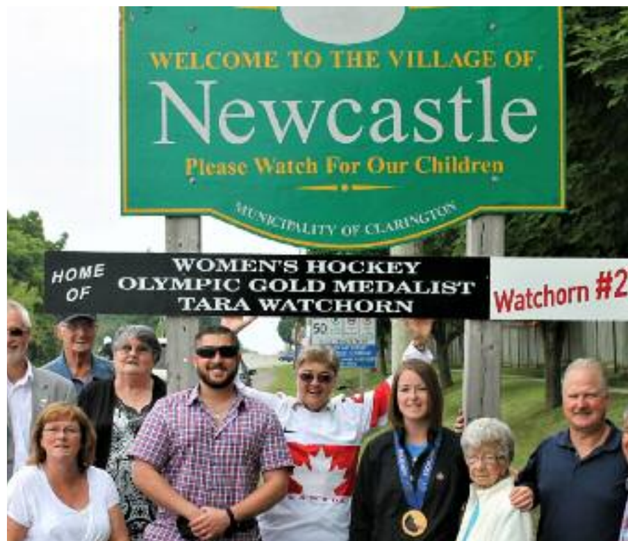
Top: Mounties. Top right: Community Hall. Above: A fine welcome to Newcastle, Ontario.