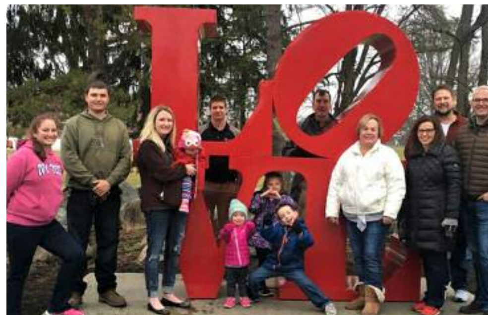
Top: Henry County court house. Above: Robert Indiana's 'Love' sculpture.