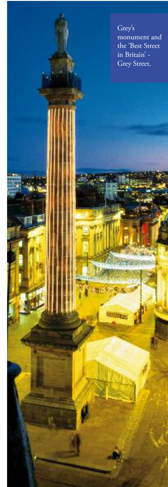
Grey's monument and the 'Best Street in Britain' - Grey Street.

Newcastle values its links with its many twin cities, including Atlanta, Bergen, Nancy and Gelsenkirchen. 'International Newcastle' is the city's networking agency, whilst tourism, inward investment and major festivals are promoted by NewcastleGateshead Initiative.