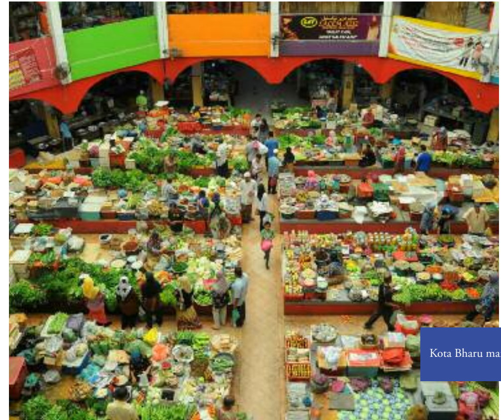
Kota Bharu market

Prior to this date, Kota Bharu was known as the centre of administration and business activities. The vast majority of the population is concentrated in urban Kota Bharu.