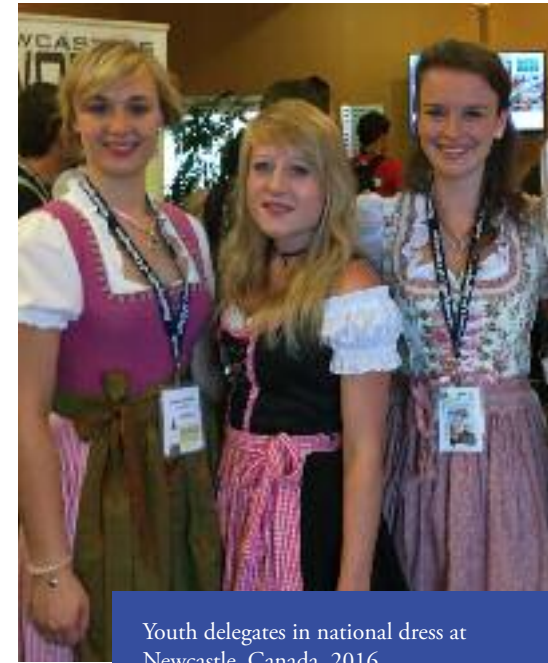
Youth delegates in national dress at Newcastle, Canada, 2016.

With the greater distances involved (and perhaps because they had hosted previously) the number of delegates to Newcastle South Africa in 2010 was fewer than in 2008.