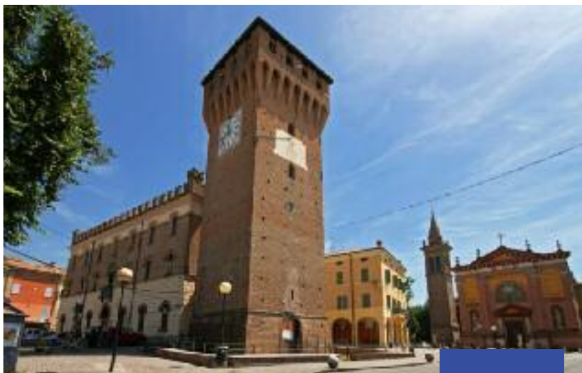
Castelnuovo Rangone, Italy.

Castelnuovo Trentino, Province of Trento (900); Castelnuovo Belbo, Province of Asti (900); Castelnuovo Bocca d'Adda, Province of Lodi (700); Castelnuovo Bormida, Province of Alessandria (700); Castelnuovo Bozzente, Province of Como (800); Castelnuovo Calcea, Province of Asti (800); Castelnuovo Nigra, Province of Turin (400); Castelnuovo Parano, Province of Frosinone (900); Castelnuovo di Ceva, Province of Cuneo (130); Castelnuovo del Friuli, Province of Pordenone (900); Castelnuovo, Avezzano, medieval town, Province of L'Aquila (200); Castelnuovo (Assisi), Province of Perugia (750); Castelnuovo (Auditore), Province of Pesaro and Urbino (10); Castelnuovo della Misericordia, Province of Livorno (165); Castelnuovo (Prato), Province of Prato (420); Castelnuovo (Vergato), Province of Bologna (10); Castelnuovo (Teolo), part of Teolo, Province of Padova (50)