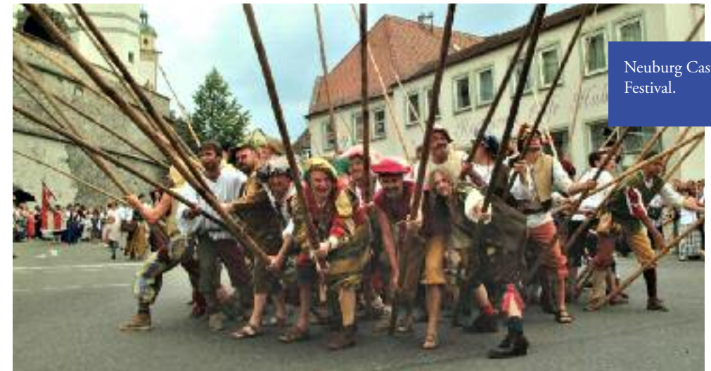
Neuburg Castle Festival.

In Neuburg an der Donau, Germany, the castle dates back to medieval times with Neuburg as a name first appearing in 1214 in parish records. Its current form as a stately palace owes its style to the first duke of the Palatinate-Neuburg Principality, who added high Renaissance gables and a beautiful courtyard surrounded by arcades in the 16th century. Later, Duke Phillip Wilhelm would add a Baroque Eastern wing and two round towers.