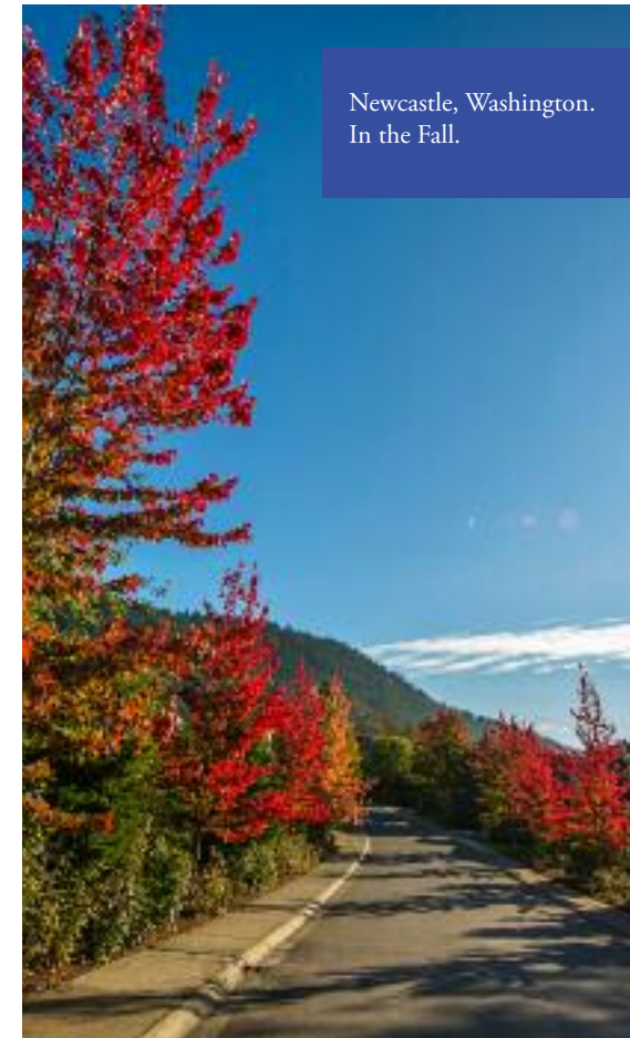
Newcastle, Washington. In the Fall.

Around thirty years after the end of the coal mining era, a successful citizen effort toward incorporation established the City of Newcastle. Today, Newcastle is made up of more than 11,500 people, and is recognised as one of the best places to live in the United States. The city is also home to the Golf Club at Newcastle, which offers world class golfing and stunning, panoramic views of Seattle. Newcastle is known for its close proximity to nature, highlighted by nearly forty acres of developed parks and a vast network of trails for people to explore.