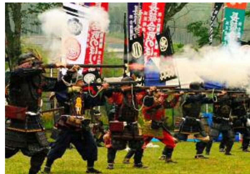
Top: Tai Chi in a park full of cherry blossoms. Middle: Horaisam Toshogu Shrine dedicated to the spirit of Tokugawa Ieyasu. Right: A re-enactment of the Battle of Shinshiro.