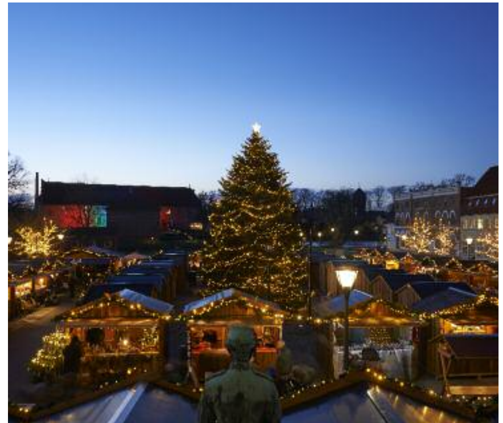
Top: Nyborg Castle royal wing and moat. Above: Christmas market in old Royal Nyborg.