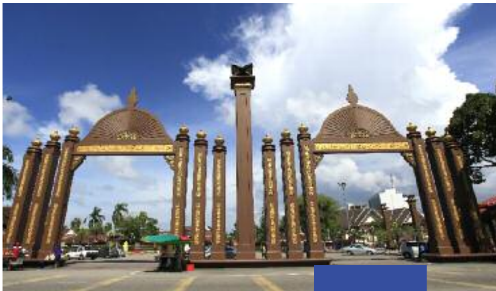
The elegant Sultan Ismail Petra Arches.

Kota Bharu's population is seventy per cent Muslim with the remainder consisting mainly of Buddhists, Hindus and Christians. On 1 October 2005, Kota Bharu was declared 'Kota Bharu, The Islamic City,' a title given to the city which observes Islamic principles in every aspect of daily life. The Azan (prayer call), can be heard everywhere, even in shopping malls but the freedom of all religions still exists.