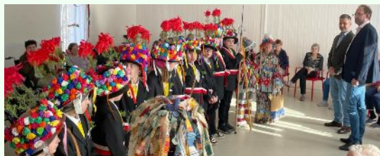
Youngsters carry on the tradition !

ABOUT NEWCASTLES OF THE WORLD : There are more than 100 different "Newcastles" or "New Castles" around the globe, in many different countries and different languages. It was the mayor of one of them, in Shinshiro, Japan, who took the initiative to bring the Newcastles together via the Newcastles of the World summit in 1998 .